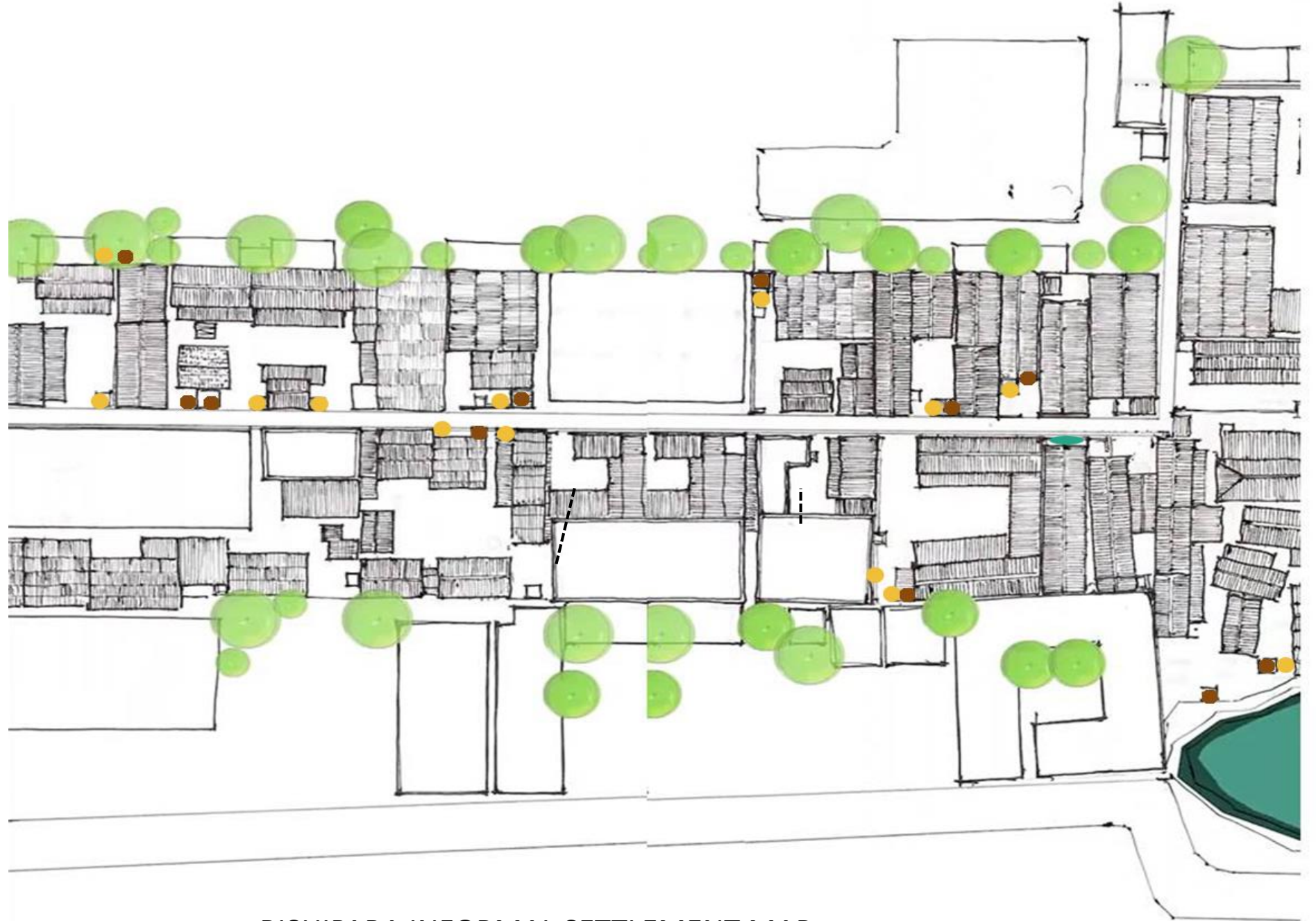
RISHIPARA INFORMAL SETTLEMENT MAP